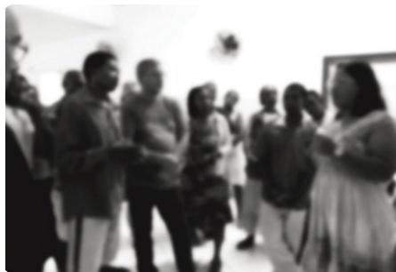
Image blurred for people's safety.